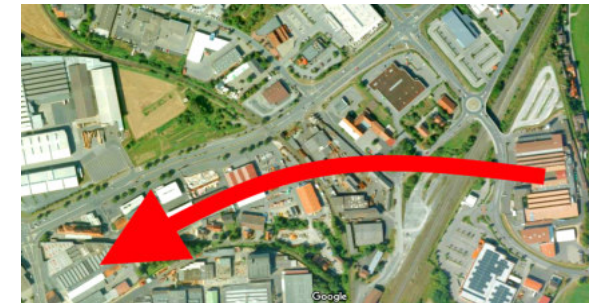
The delivery route between factory 1 and factory 2 in Bad Neustadt (Bavaria).

The first fully autonomous delivery drone - developed by Emqopter - originates from a pilot project in Bavaria. The Drone transports small parts and food between two facilities in the city of Bad Neustadt. The facilities are located approx. 600 meters away from each other within the urban area. For the authorization and the greatest possible safety of the autonomous flight operations, a new sensor system for environmental monitoring has been developed.