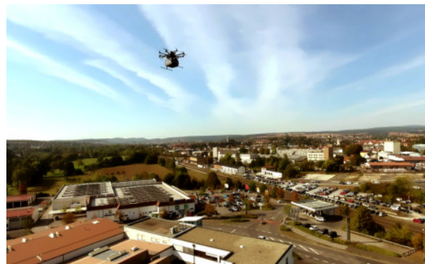
The first fully autonomous delivery drone.

The patent-pending sensor concept collects environmental data for reliable obstacle detection and enables autonomous take-offs and landings at the destination of choice.